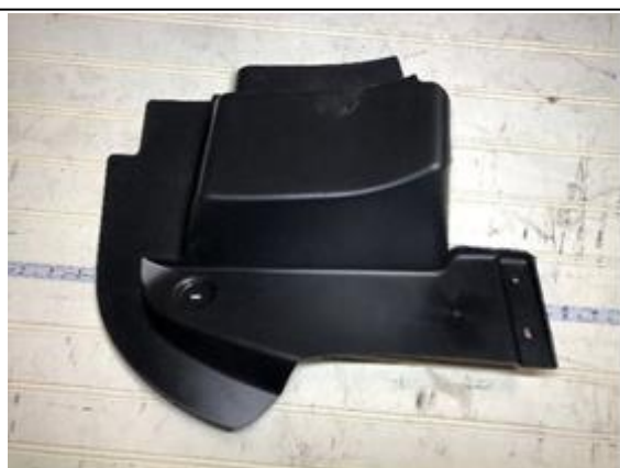
Figure 6 - Right Side After Trimming