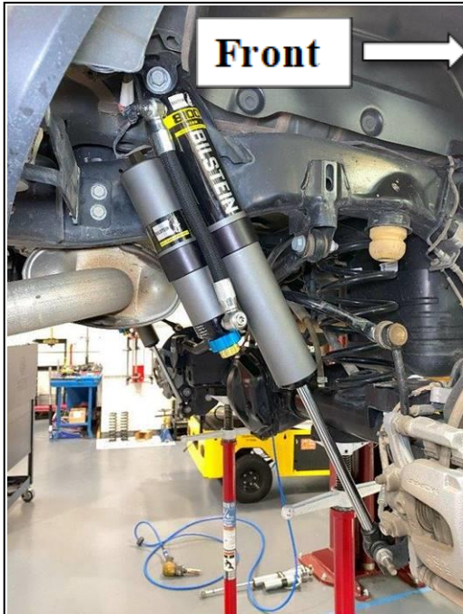
Figure 3 - Rear Passenger Side