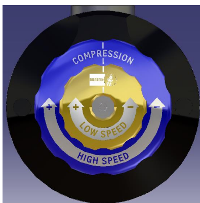
Dual Speed Reservoir Adjuster

Please note: It's normal for the high speed (blue) knob to become significantly more difficult to turn when progressing to the firmer end of the adjustment range; particularly during the last 3 to 4 settings/clicks. This increased difficulty is a result of the increasing preload of the high speed valve stack shims. To aid in ease of adjustment at the firmest end of the high speed range, it's optional to use Bilstein wrench part # E-XS01-0000004. This is included in most kits and if not, available separately. Additionally, it's normal for the clicks on the high speed (blue) knob to become less pronounced at the firmer end of the adjustment range.