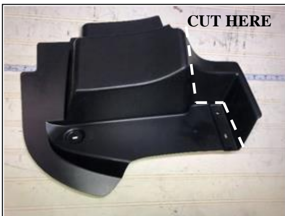
Figure 5 - Right Side Before Trimming