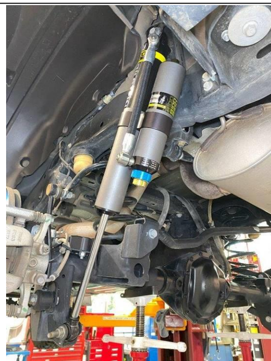
Figure 2 - Rear Driver Side