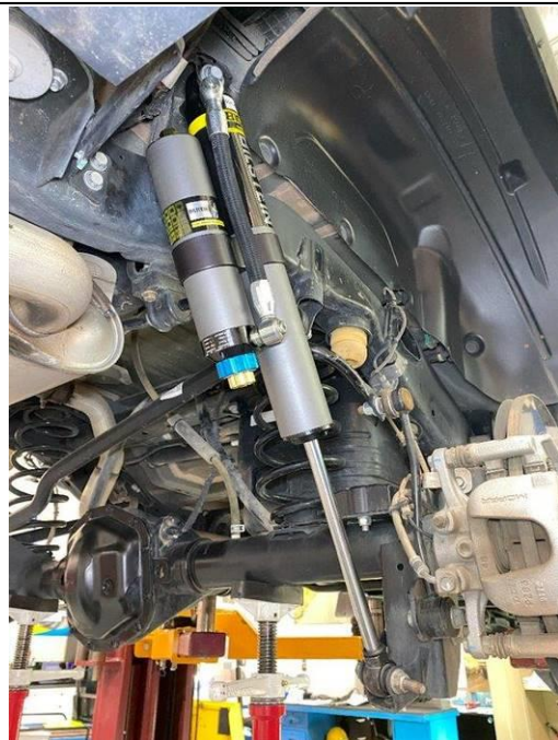
Figure 4 - Rear Passenger Side