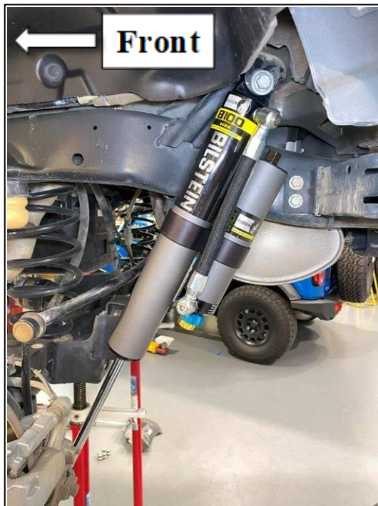
Figure 1 - Rear Driver Side