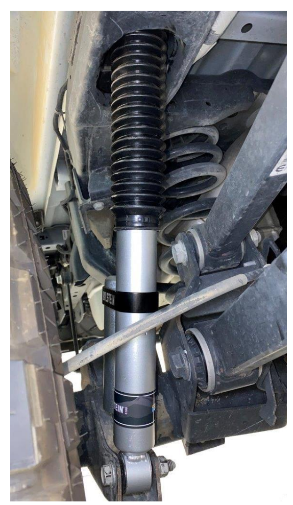
Figure 2 – Passenger side (looking towards the rear)