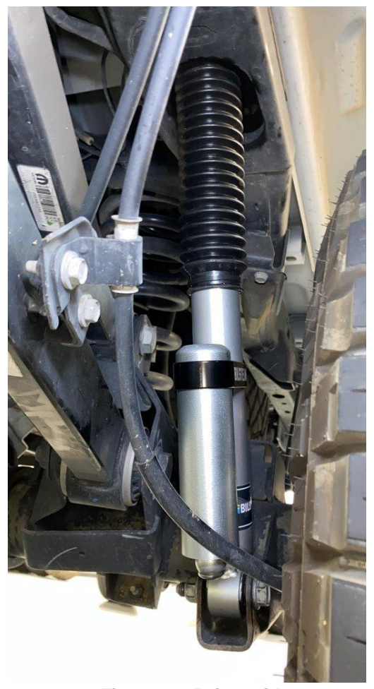
Figure 3 – Driver side (looking towards the rear)