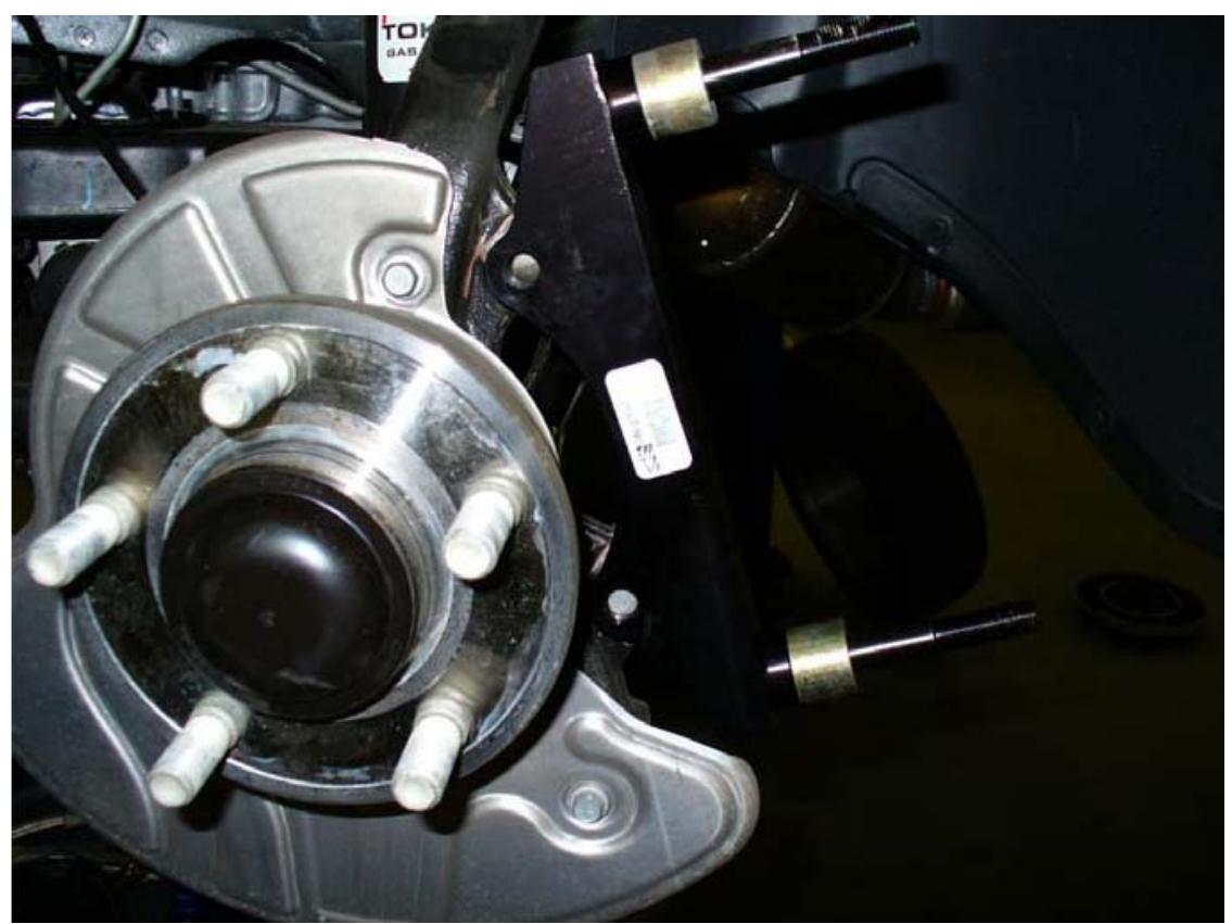
Photo 3: Extreme + bracket pictured, Pro + will have NO spacers or studs.

Install intermediate bracket (see photo 3) using original anchor bolts. The scalloped area on the bracket will clear the ears on the spindle, this installs on the outboard side. Torque to 85 ft-lbs.