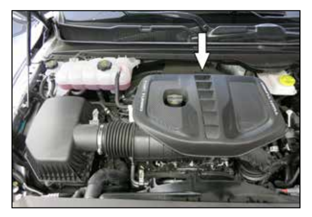
2. Remove the bolt that secures the center of the engine cover then lift the cover up and remove it from the engine.

NOTE: Disconnecting the negative battery cable erases pre-programmed electronic memories. Write down all memory settings before disconnecting the negative battery cable. Some radios will require an anti-theft code to be entered after the battery is reconnected. The anti-theft code is typically supplied with your owner's manual. In the event your vehicles anti-theft code cannot be recovered, contact an authorized dealership to obtain your vehicles anti-theft code.