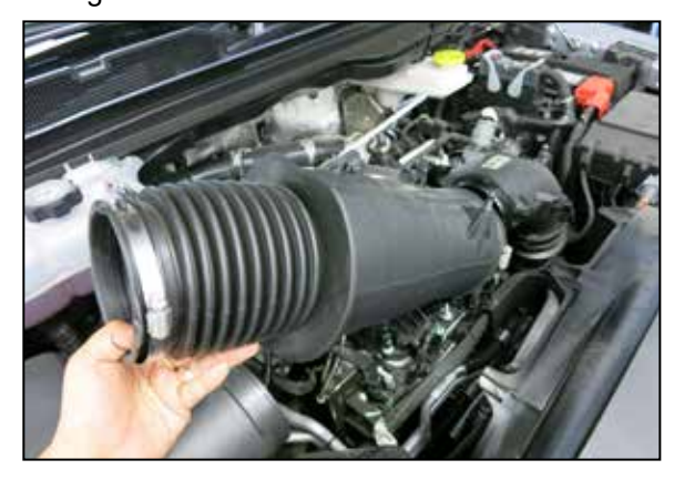
7. Disconnect the intake tube from the air-filter housing and then remove it from the vehicle.