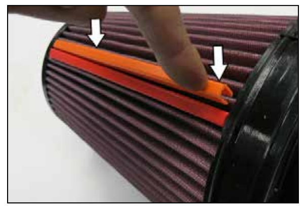
11. Attach the filter clips to the pleats on the air filter align and push down. Passenger side filters, place orange clip on top and red on bottom.

10. Install the four-factory air filter housing mounting grommets into the K&N air filter housing and then install the K&N housing into the vehicle so the mounting pins protrude through the grommets.