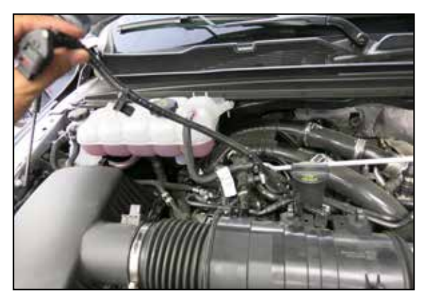
4. Disconnect the mass air sensor electrical connection and then unhook the harness from the intake tube.