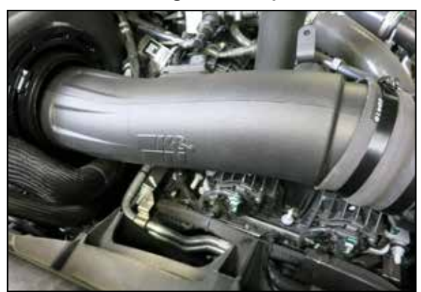
17. Install the K&N intake tube assembly into the air filter and then into the coupler, the coupler will need to flexed around the tube. Align the tube for

8. Lift the air filter housing up and remove it from the vehicle.