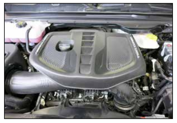
20. Reinstall the engine cover and secure with the factory mounting bolt.