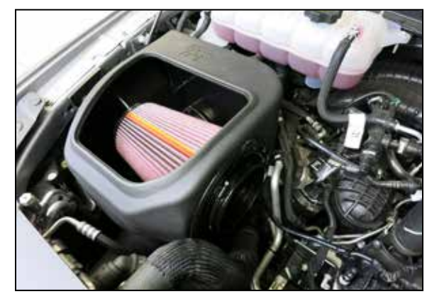
12. Install the K&N air filter into the air filter housing.