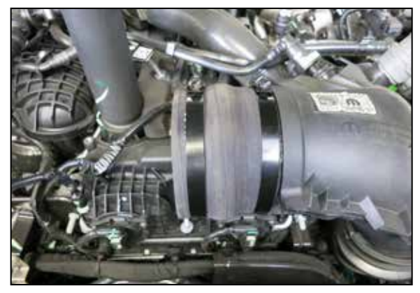
16. Install the provided hump coupler onto the intake plenum with the provided hose clamp. Tighten clamps using 5/16" socket or nut driver. Note: Do not over tighten clamps.

NOTE: Double check to make sure the sensor is installed in the correct direction, the small opening at the bottom of the sensor should be pointed towards the air filter when correct.