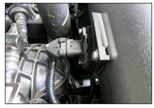
18. Reconnect the mass air sensor electrical connection.