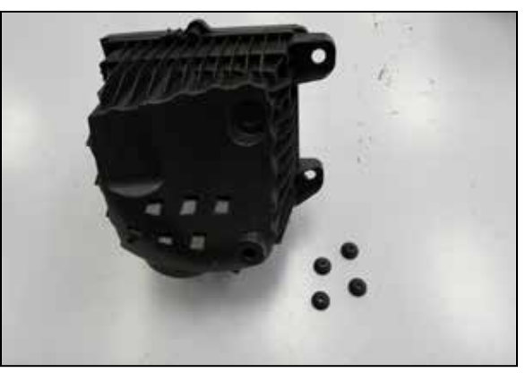
9. Remove the four mounting grommets from the factory air filter housing.