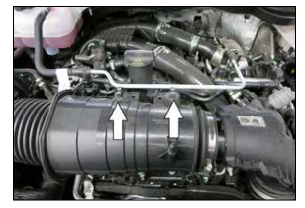
3. Disconnect the coolant by-pass line from the factory intake tube.