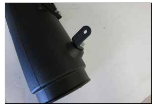
14. Install the provided mounting bracket onto the K&N intake tube using the provided hardware.