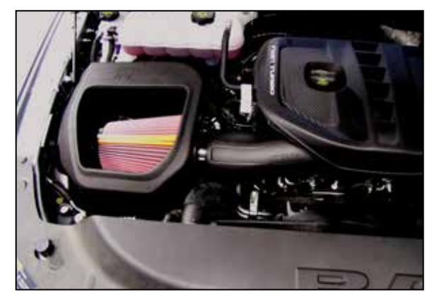
21. Reconnect the vehicle's negative battery cable. Double check to make sure everything is tight and properly positioned before starting the vehicle.

22. It will be necessary for all K&N<sup>®</sup> high flow intake systems to be checked periodically for realignment, clearance and tightening of all connections. Failure to follow the above instructions or proper maintenance may void warranty.