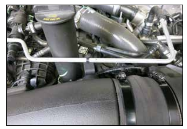
19. Secure the coolant by-pass line to the bracket with the provided mounting cable tie.