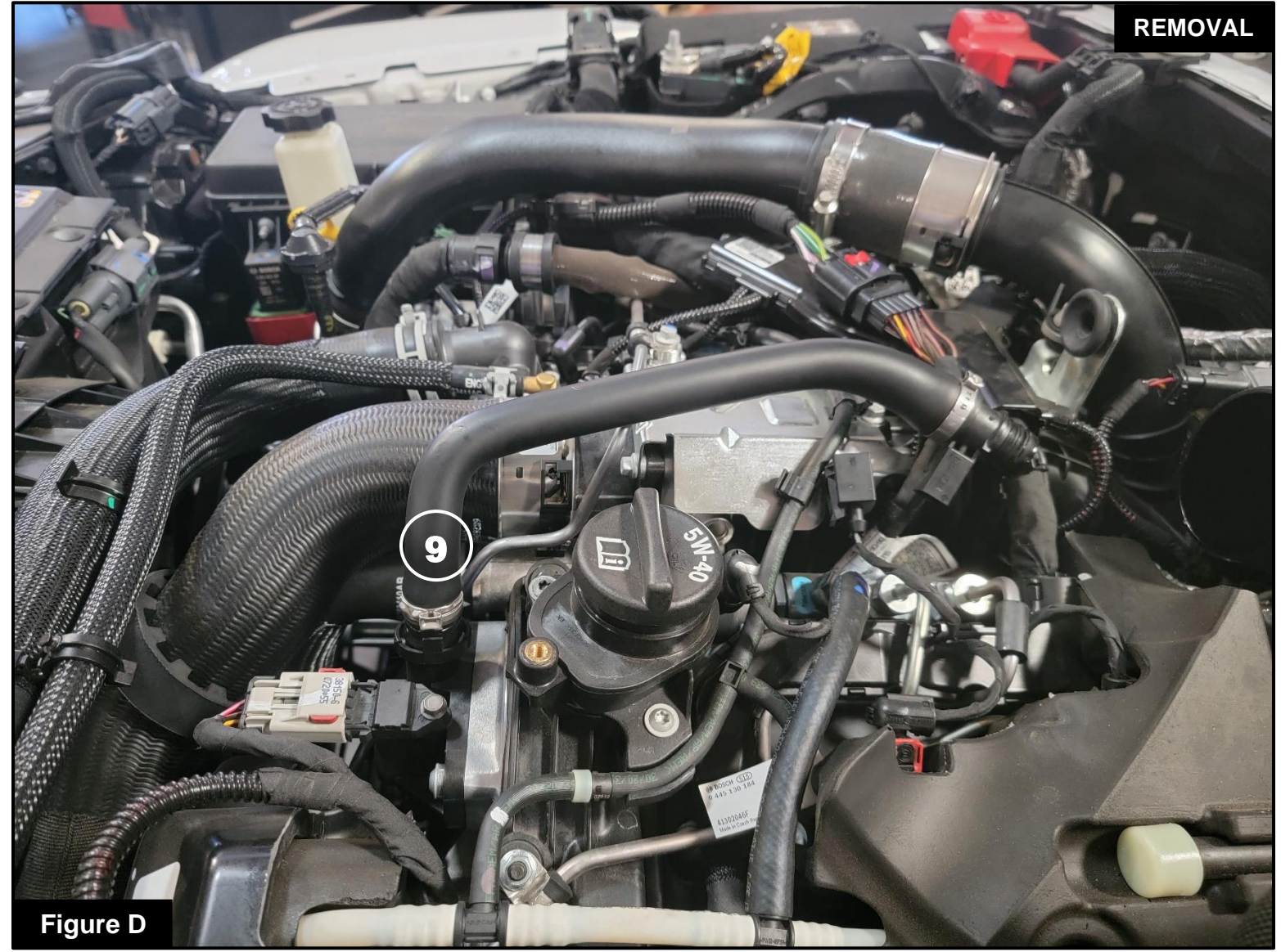
Refer to Figure D for Step 11