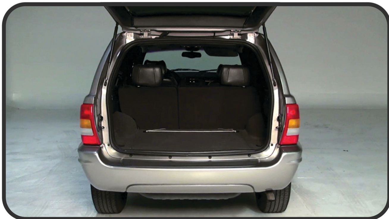
STEP 2: OPEN THE TAIL GATE