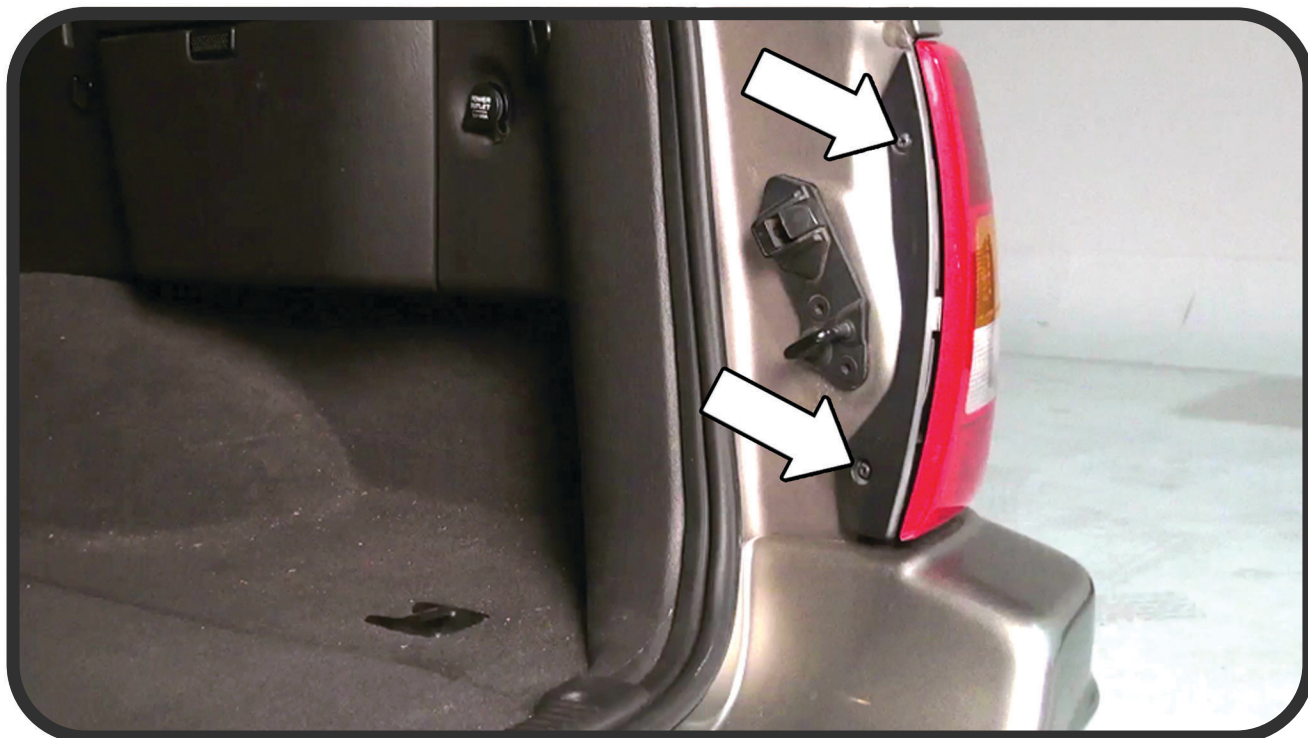
STEP 3: REMOVE (2) PHILLIPS SCREWS SECURING THE TAIL LIGHT