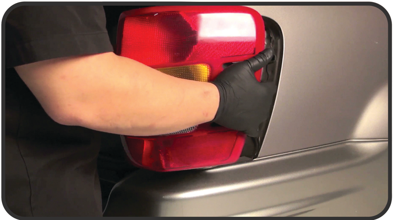
STEP 4: UNSEAT THE OLD TAIL LIGHT