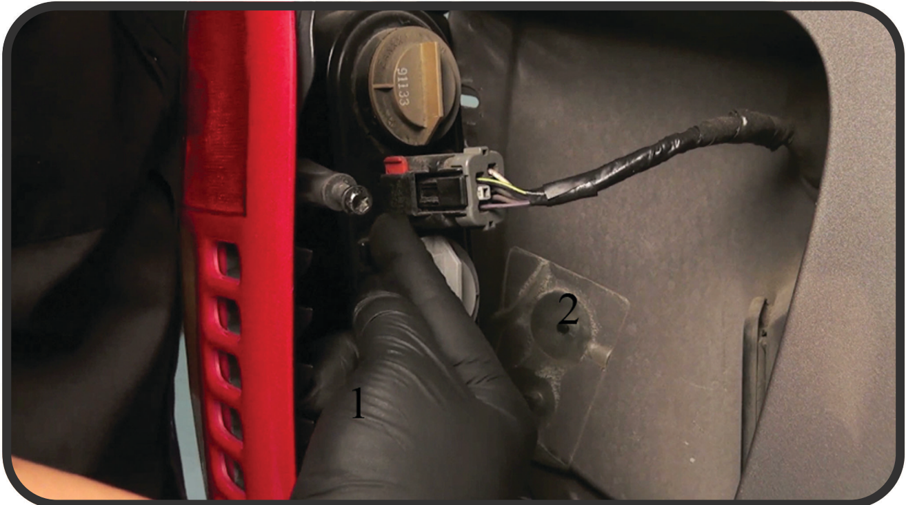
STEP 5: DISCONNECT THE TAIL LIGHT HARNESS BY PUSHING UP ON THE RED TAB TO UNLOCK IT